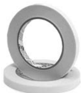
#17035 Double Sided Tape 12mm x 33m

This general-purpose tape is perfect for many tasks in picture framing. It is ideal for adhering mat boards together when cutting double, triple or creative mats, positioning delicate artwork and many other paper craft projects.