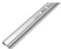
#14209 Mat Master™ Rule