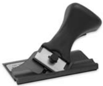
#14201L Mat Master™ #201 Bevel Cutter #14201R Mat Master™ #201 Bevel Cutter