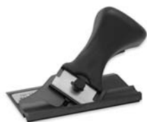
#14201L Mat Master™ #201 Bevel Cutter #14201R Mat Master™ #201 Bevel Cutter