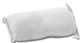
#17453 Document Cleaning Pad

An embossed line on a mat gives a very subtle decorating touch and it is very easy to achieve using the FrameCo embossing tool.