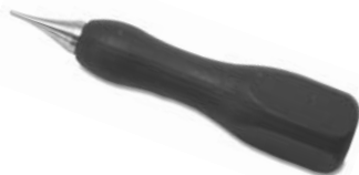
#14422 Mount Embossing Tool