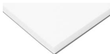
#80011 Fome Core