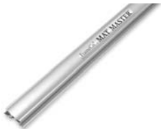
#14209 Mat Master™ Rule